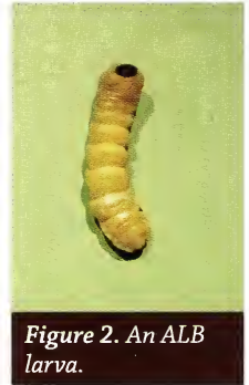
Figure 2. An ALB larva.

There, the larvae tunnel, feed, and develop over the winter. The following summer, they chew their way out of the host tree as adult beetles to mate and lay eggs, starting the process again with a new generation of beetles. Typically, adult beetles lay eggs in the same tree from which they emerged, making that tree host to generations of ALB if they are not stopped through eradication activities.